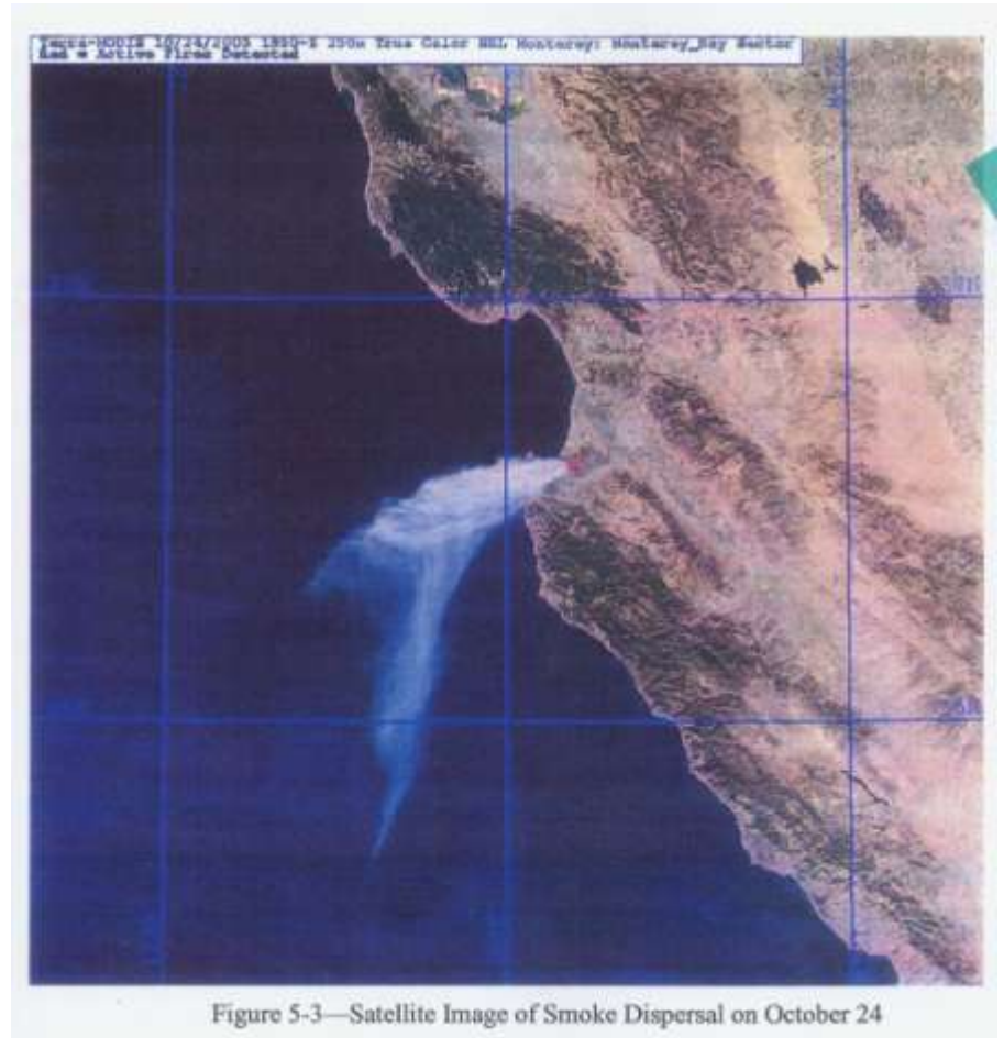
Figure 5-3—Satellite Image of Smoke Dispersal on October 24