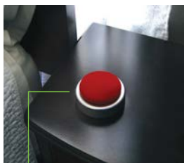
Alert buttons can be placed in high-traffic areas of the home

With Seniors Care from Liberty, discover the peace of mind that comes with having complete insight into the daily routines and happenings inside the home of your aging family members.