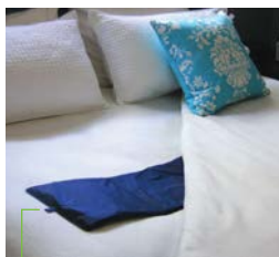
Bed sensors make it easy to see if your mom got out of bed this morning