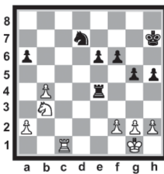
Chess Tactics: White to Set a Pin