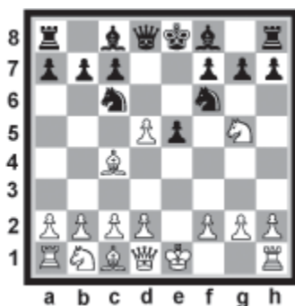
Chess Openings: Two Knights Defense