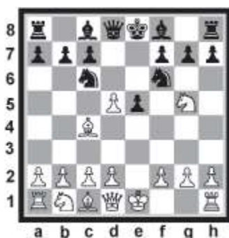
Chess Openings: Two Knights Defense