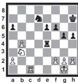
Chess Tactics: White to Set a Pin