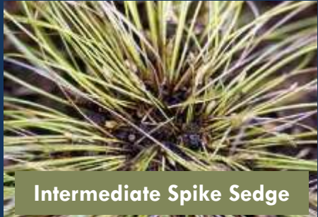
Intermediate Spike Sedge