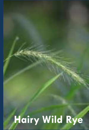
Hairy Wild Rye