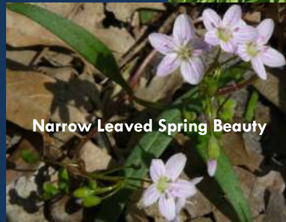
Narrow Leaved Spring Beauty