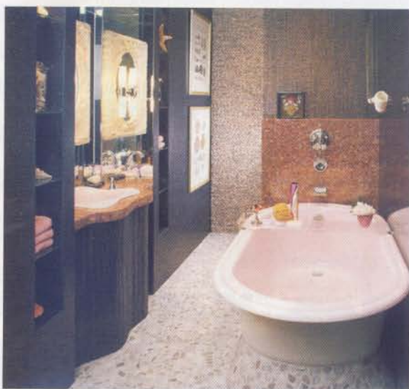
"A Shell Collector's Bathroom"

As you walk through the tower of shower power, tile in Luxor Grey and Linen brings your eye past the shower area to an intimate powder room with walls covered in a geometric linen fabric and a luxurious wall of curtains that partitions a private toilet area with a Leighton Comfort Height toilet and a lavatory in Kohler Cashmere colors.