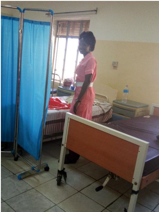
JCONAM third-year midwifery student now working independently in the Maternity ward.