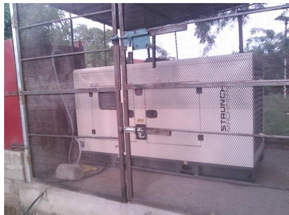
RMF's new generator at JTH, serving our Juba office.