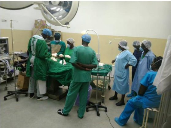
Senior surgeon mentoring intern doctors after an emergency laparotomy in the A&E department