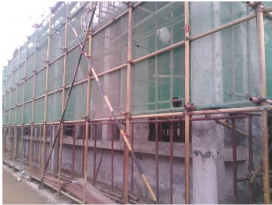
New maternity construction is ongoing.