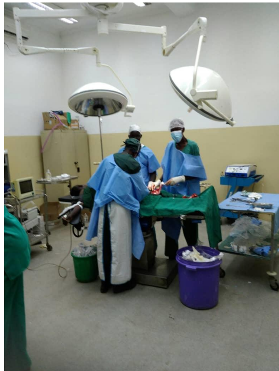
JTH doctors performing an ovarian cystectomy