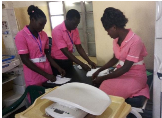
Many JCONAM students complete their clinicals at JTH.