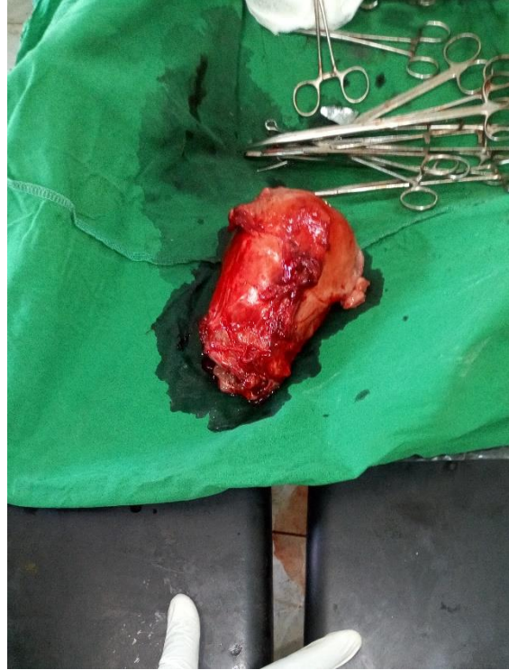
A mother safely underwent a total hysterectomy.