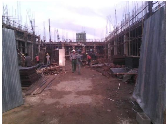
New Pediatric ward construction is ongoing.