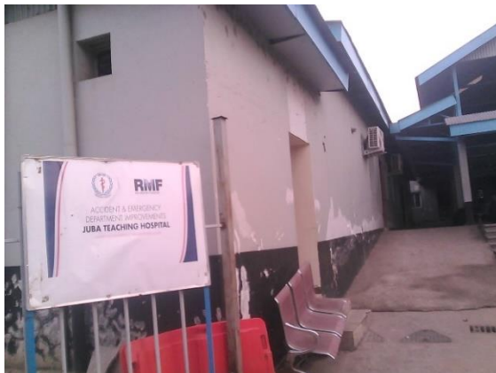
A&E ward renovated by RMF