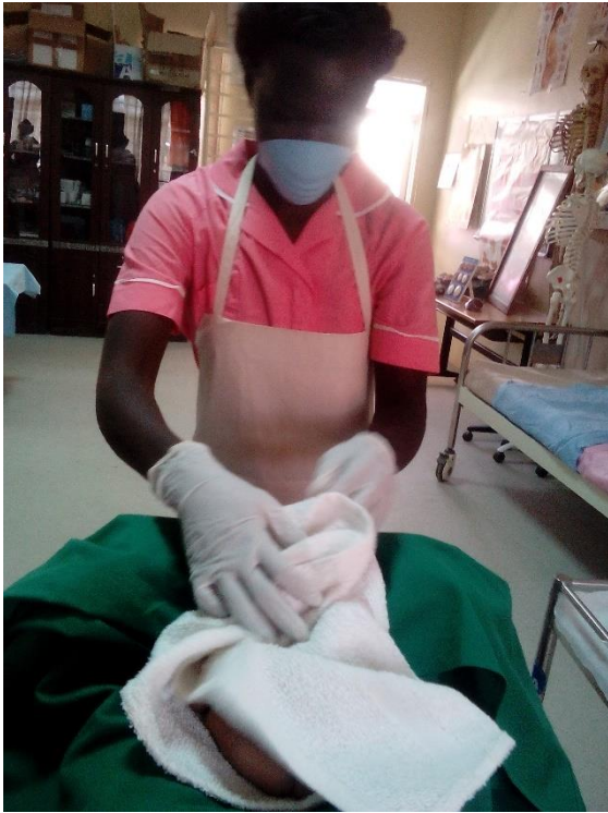
JCONAM third-year student demonstrating early prevention of hypothermia immediately after delivery