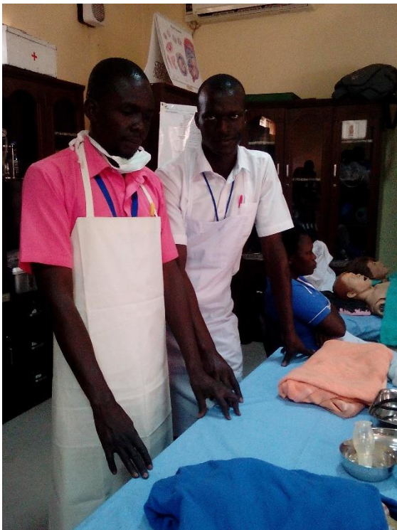
JCONAM students have the freedom to access practical rooms for training demonstrations.