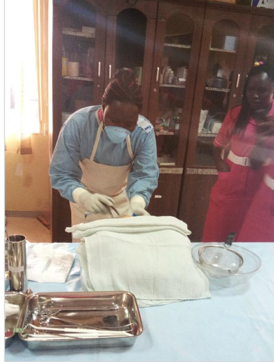
JCONAM midwifery student demonstrating how to insert a vaginal speculum with minimal risk of trauma and infection