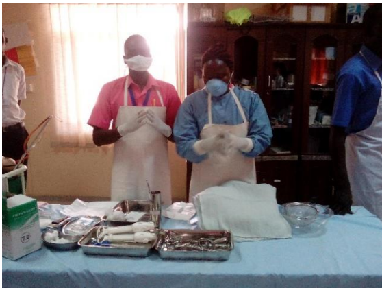
JCONAM midwifery student demonstrating how to conduct manual vacuum aspiration (MVA) during an emergency