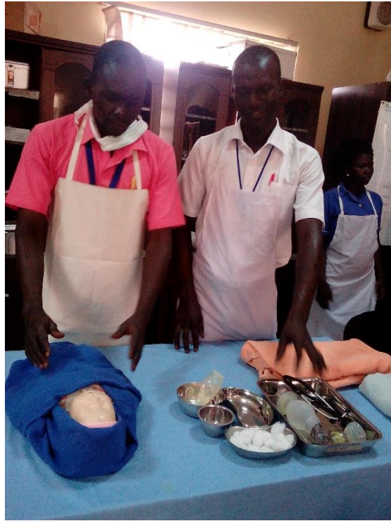
Students showing how to set up and perform resuscitation of a newborn with a low Apgar score