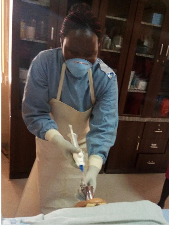
JCONAM student demonstrating how to perform non-septic manual vacuum aspiration (MVA)