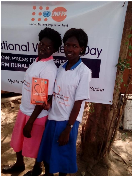
JCONAM students advocating for access and uptake of female condom use