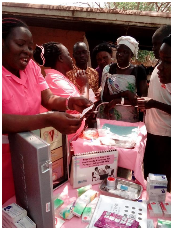
Counseling attendees on safe reproductive health practices