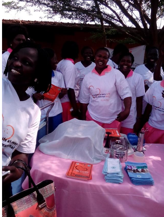
JCONAM midwifery and nursing students jointly commemorating World AIDS Day with health messages for prevention