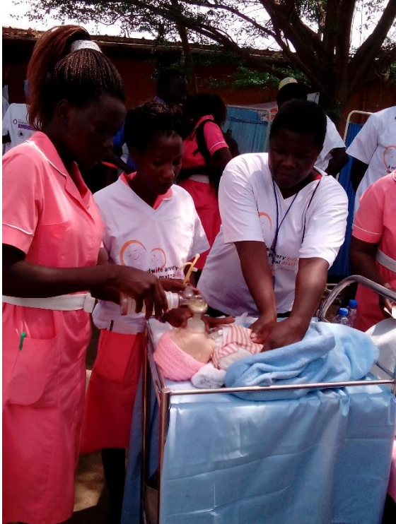
JCONAM midwifery students demonstrating how to conduct positive pressure ventilation for a child who fails to establish normal breathing after resuscitation